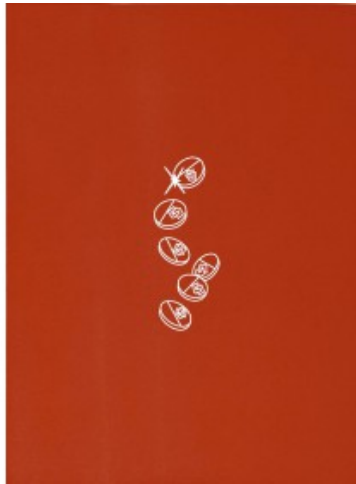
KOOLHAAS. GREAT LEAP FORWARD