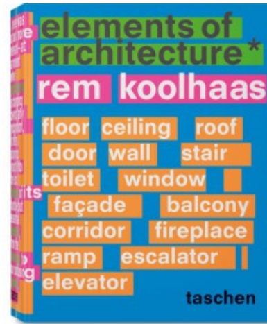
REM KOOLHAAS. ELEMENTS OF ARCHITECTURE