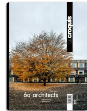
N.192 6A ARCHITECTS A.A.V.V. 9788494775406 64.00€