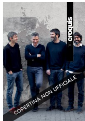
N.203 HARQUITECTES (2010-2020)