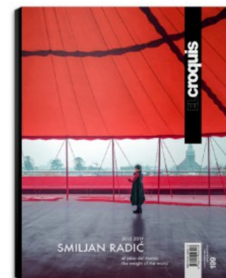
N.199 SMILJAN RADIC (2013-2019) AA.VV. 9788412003413 89.00€