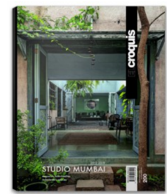
N.200 STUDIO MUMBAI (2012-2019) AA.VV. 9788412003420 78.00€