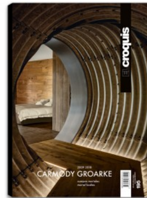
N.195 CARMODY GROARKE (2009-2018) AA.VV. 9788494775444 64.00€