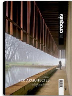
N.190 RCR ARCHITECTS 2012 - 2017 AA.VV. 9788488386960 78.00€