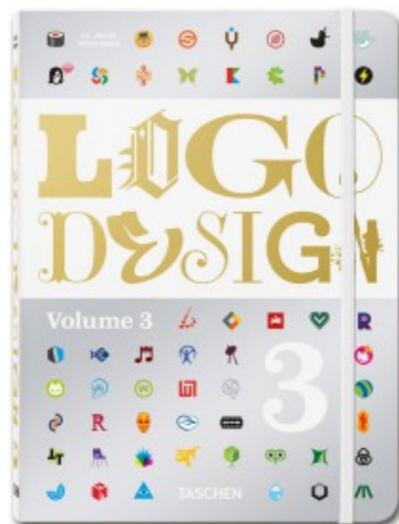
LOGO DESIGN 3 (IEP)