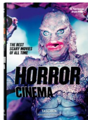
HORROR CINEMA - #BIBLIOTHECAUNIVERSALIS