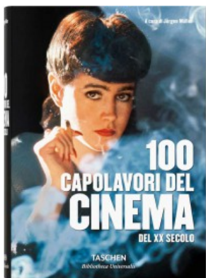
100 CAPOLAVORI DEL CINEMA DEL XX SECOLO