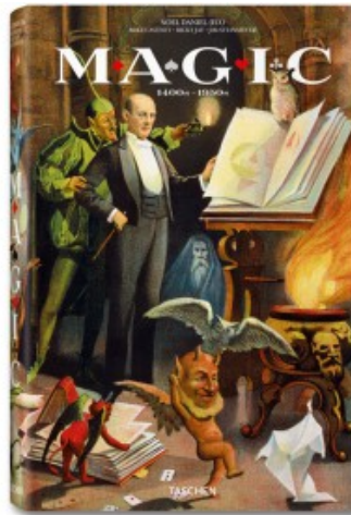
MAGIC BOOK (IEP)