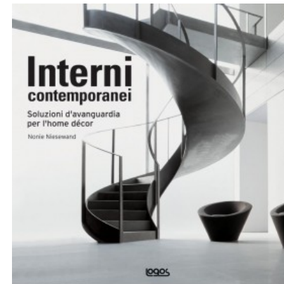
INTERNI CONTEMPORANEI - SOLUZIONI D'AVANGUARDIA PER L'HOME DÉCOR