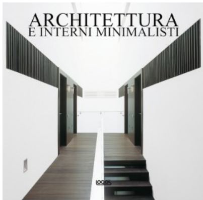
ARCHITETTURA E INTERNI MINIMALISTI