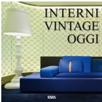
INTERNI VINTAGE OGGI