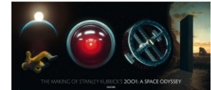
THE MAKING OF STANLEY KUBRICK'S '2001: A SPACE ODYSSEY' - VA