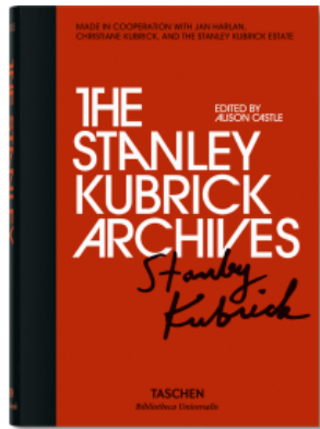
THE STANLEY KUBRICK ARCHIVES