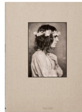
BEFORE EASTER AFTER - LIMITED EDITION Lynn Goldsmith 9783836573863 600.00€