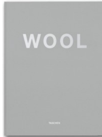
CHRISTOPHER WOOL - LIMITED EDITION