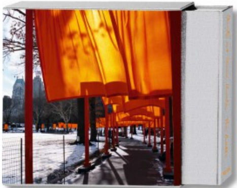
CHRISTO & JEANNE-CLAUDE. THE GATES - LIMITED EDITION