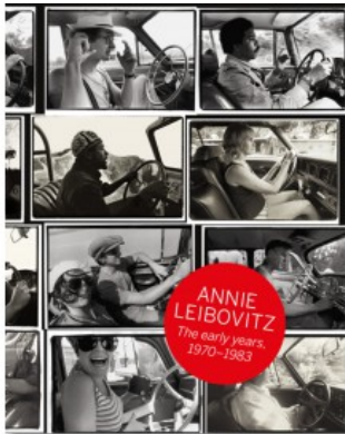
ANNIE LEIBOVITZ: THE EARLY YEARS 1970-1983 Annie Leibovitz, Luc Sante, Jann S. Wenner 9783836571906 40.00€