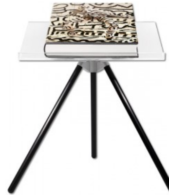
ANNIE LEIBOVITZ - ART EDITION Annie Leibovitz 9783836535717 5,000.00€