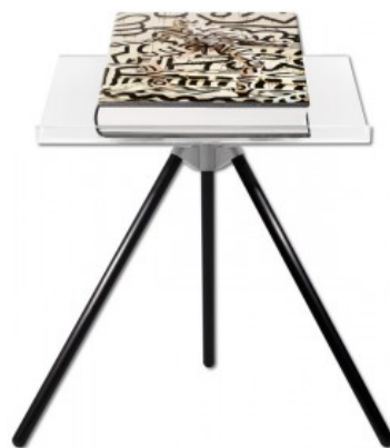
ANNIE LEIBOVITZ - ART EDITION