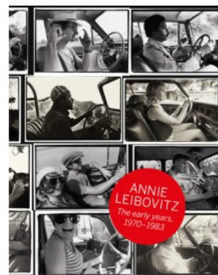
ANNIE LEIBOVITZ: THE EARLY YEARS 1970-1983