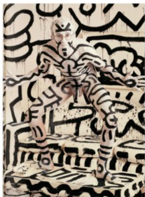
ANNIE LEIBOVITZ CON COPERTINA KEITH HARING - LIMITED EDITION