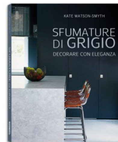
SFUMATURE DI GRIGIO. DECORARE CON ELEGANZA