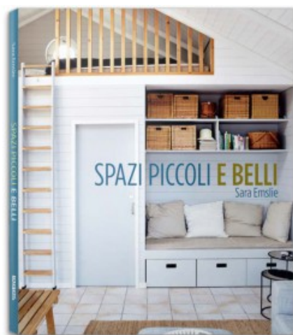
SPAZI PICCOLI E BELLI