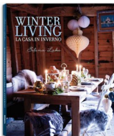
WINTER LIVING. LA CASA IN INVERNO