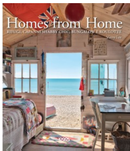
HOMES FROM HOME. DAI CAPANNI SHABBY CHIC AI BUNGALOW E ALLE ROULOTTE