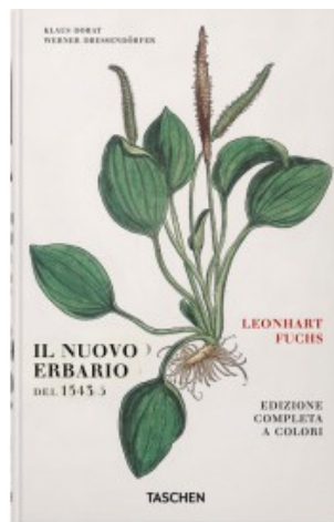
LEONHART FUCHS: IL NUOVO ERBARIO DEL 1543